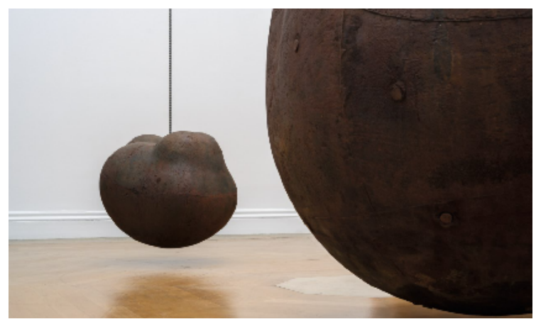
Antony Gormley, BODY , 1991/93 and FRUIT , 1991/93 Cast iron and air, 233 x 265 x 226 cm and 110.7 x 129.5 x 122.5 cm Installation View, Royal Academy, 2019

The exhibition culminates in Hall 5 with four 'Expansion Works' that came out of an obsession with renegotiating the boundary of the skin and are what Gormley has called 'contained explosions' that expand the skin's surface by pushing outwards. Hall 5's mezzanine level will allow visitors to look down on these sculptures - a unique opportunity and the first of its kind for these particular works.