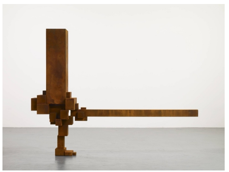
Antony Gormley, BUNCH , 2010 Cast iron, 183 x 242 x 48.8 cm Photograph by Stephen White, London © the artist

Speaking on the exhibition and its urgent message, Gormley has said: 'This show reflects on the way that we have become increasingly contextualised by the built environment. The old saying that we make a world but then the world makes us has never been truer. I'm trying to reconcile the cyber world with the biological world and this show is a materialisation of the tension between them.'